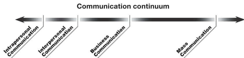
Figure 1.1 Intrapersonal communication is at the far left of the continuum and is an internal communication process. Interpersonal communication involves two or more people, but usually involves small groups where members interact with one another. Business communication reaches both small and large audiences, all of which have something in common – a stake in the organization. Mass communication is on the far right, reaches an impersonal public audience.

In this book, the model of transactional communication forms the basis of our discussion on how organizational communication works and the role of integrated communication in that process.