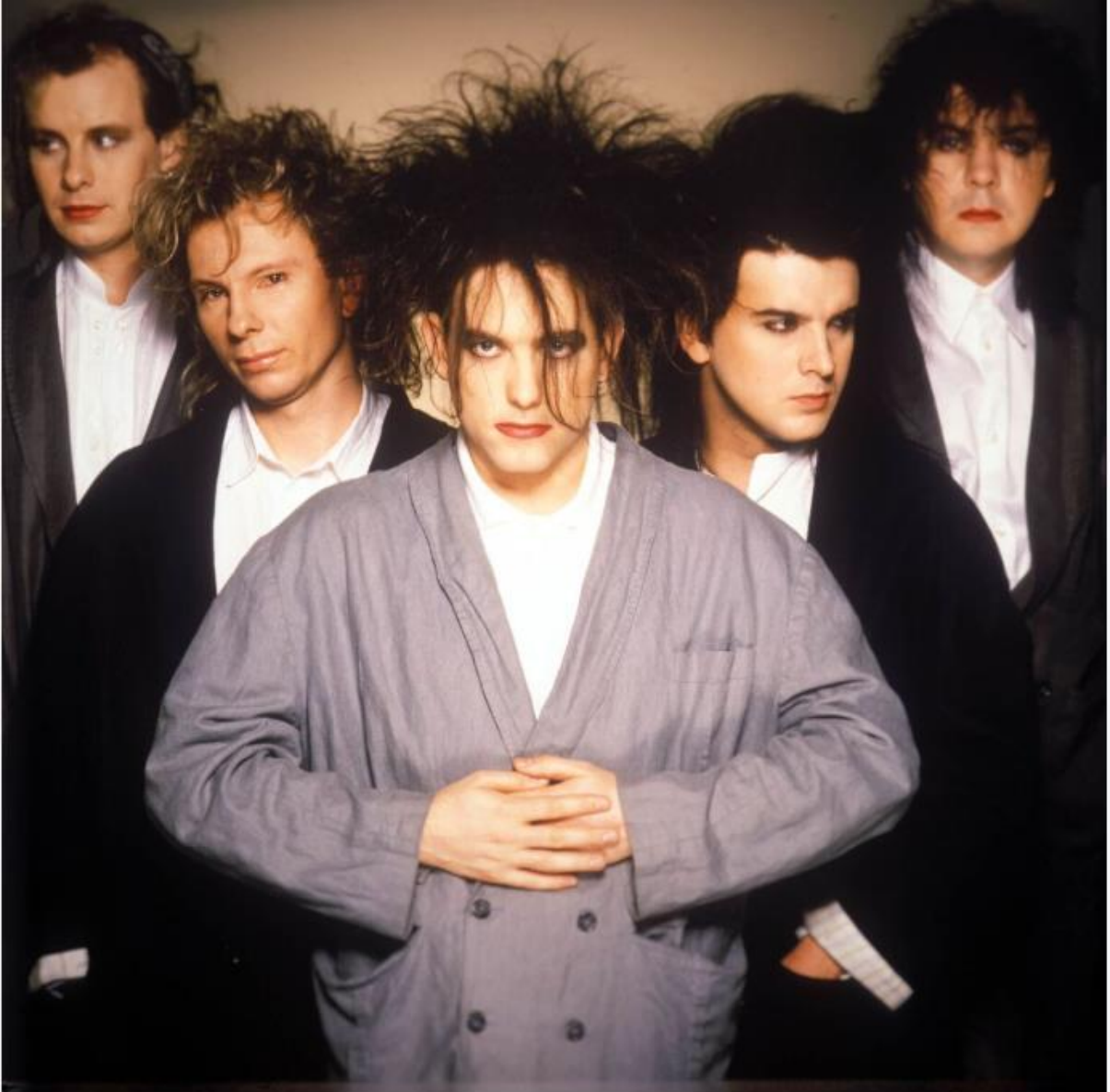
Page 117: A cult band about to go supernova.