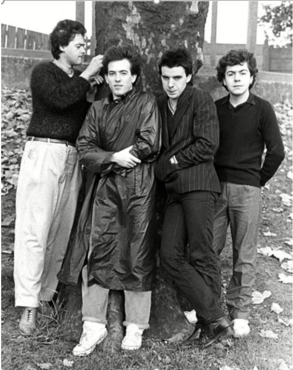
Page 48: The world's worst identity parade: The Cure, 1980.