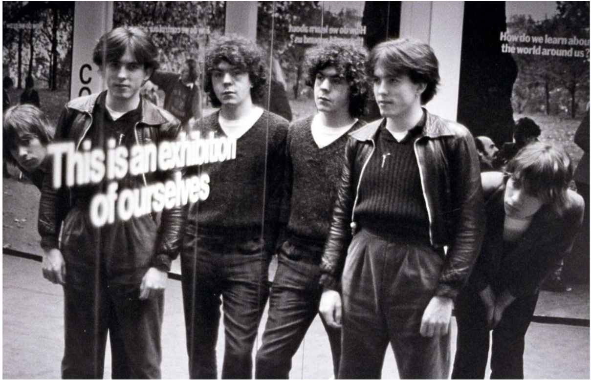
Page 12: Image? What image? The very unstylish early Cure.