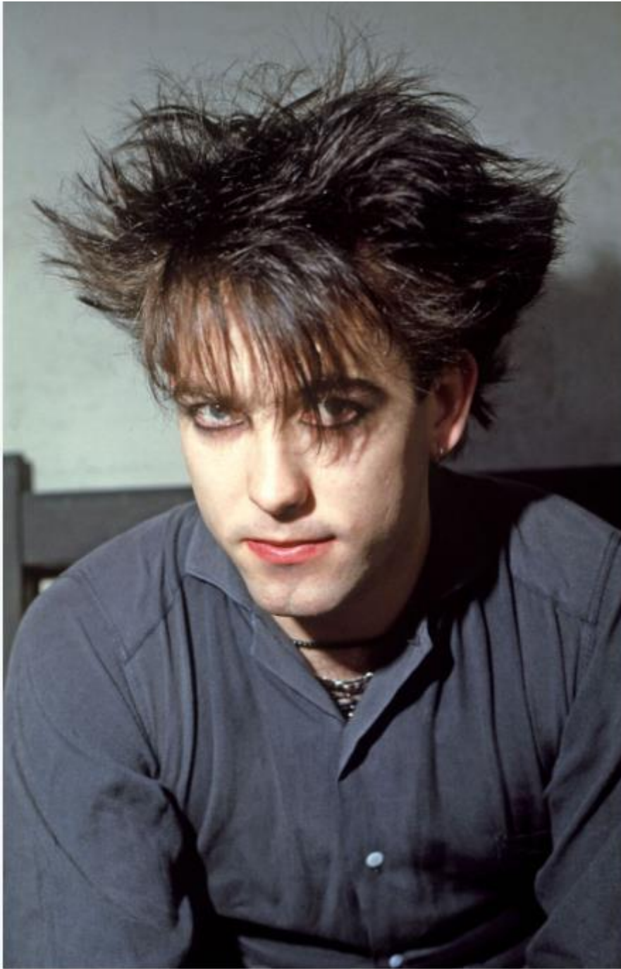
Page 85: Portrait of the artist as an angry young haircut: Robert Smith, 1982.