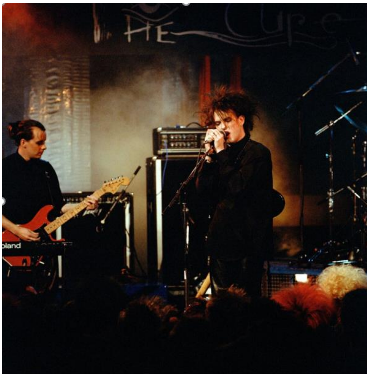
Page 107: On The Tube, April 1984