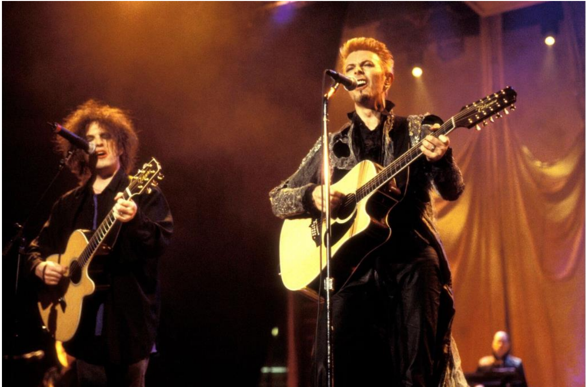
Page 193: David Bowie's 50th birthday celebration, Madison Square Garden, New York City, January 9, 1997.