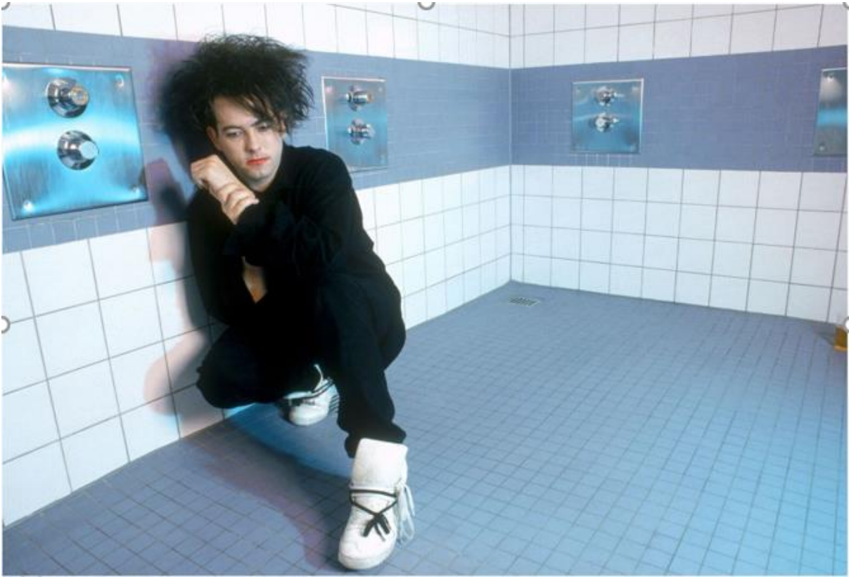
Page 136: Celebrity sat heavily on Robert Smith